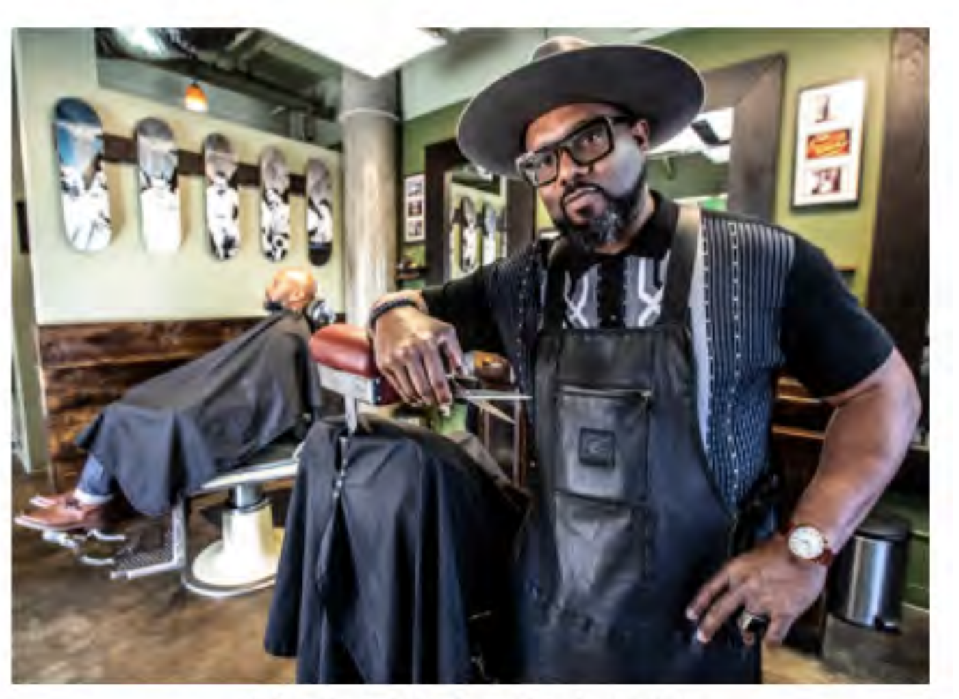
Charles Blades Barber Spa

Oakland's <u>soul food</u> landmark wants to get their indoor space in tip-top shape as they welcome back their devoted customers for indoor dining.